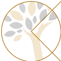
Vacant Citizen Member