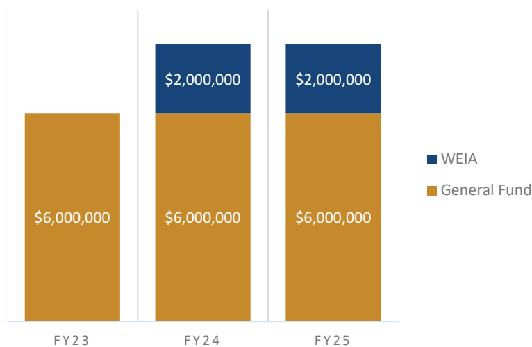
Figure 1. Allocations from the State to Date, Totaling $22 Million

Governor Inslee initially proposed funding the Washington Career and College Pathways Innovation Challenge program account, known in implementation as Regional Partnerships, with $50 million over the first three years. RP received a $6 million investment and an additional $16 million appropriation, totaling $22 million for the initial three years (Figure 1). Of this funding from the state, $8 million per year is considered maintenance level.