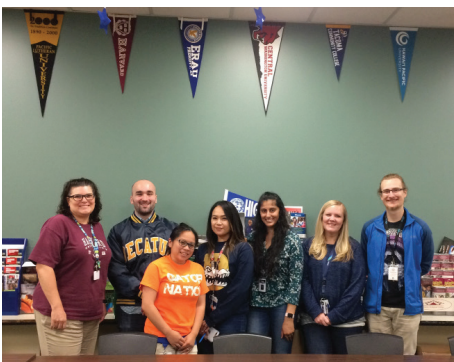
12th Year Campaign Team Decatur High School in Federal Way

From welding to nursing, from English to computer science—whether 18-month apprenticeship or 4-year college degree—whatever the goal, Washington College Grant can help. Students apply by simply completing a FAFSA or WASFA at a 12th Year event.