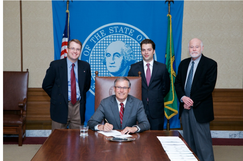
Above: Governor Jay Inslee signing SB 5180 May 14, 2013